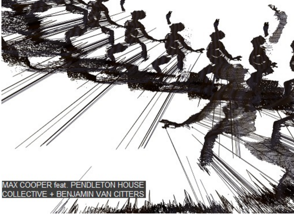
MAX COOPER feat. PENDLETON HOUSE COLLECTIVE + BENJAMIN VAN CITTERS